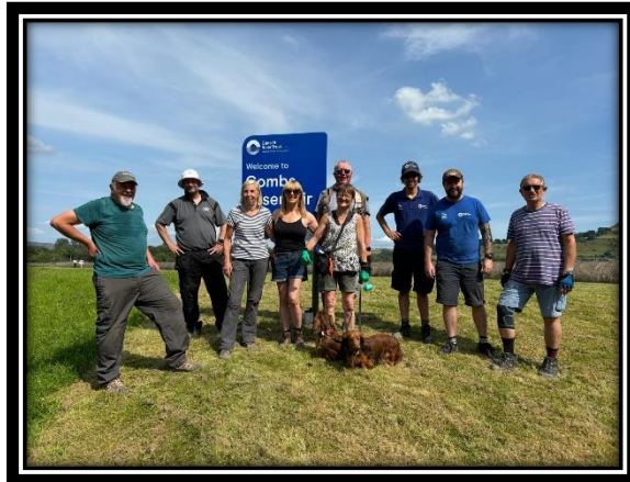
Local volunteers and some of the Canal and River Trust Team