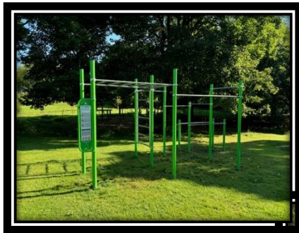
The new Trim Trail is located adjacent to green asymmetric bars

The equipment for older adults is set around on the main path, so they can be accessed easily. There are four pieces of apparatus – a hand bike to increase upper body strength, a station for improving balance and core strength, a station for improving ab and core